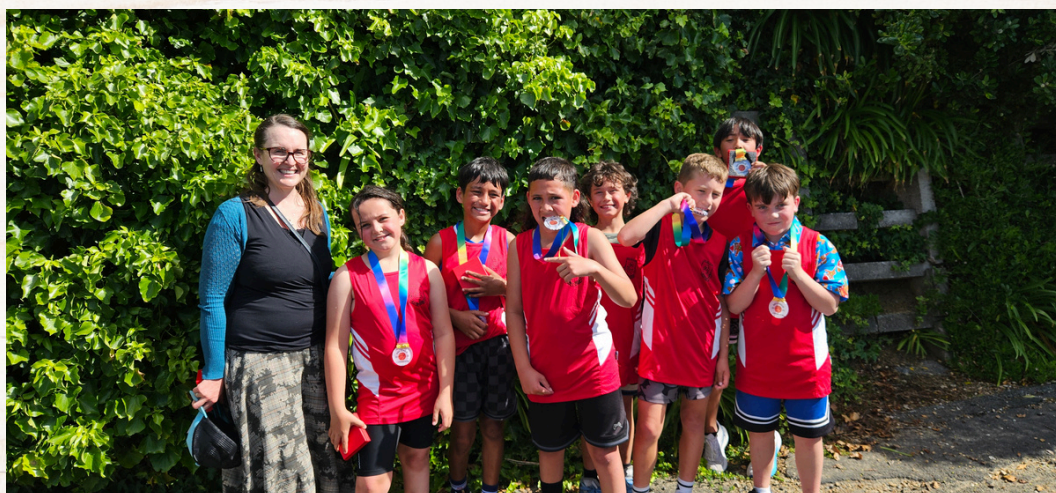
Year 5, Term 4 Champions